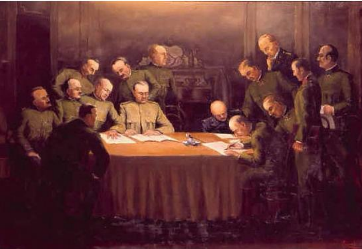
Villa Giusti, Padua, 3 rd November 1918