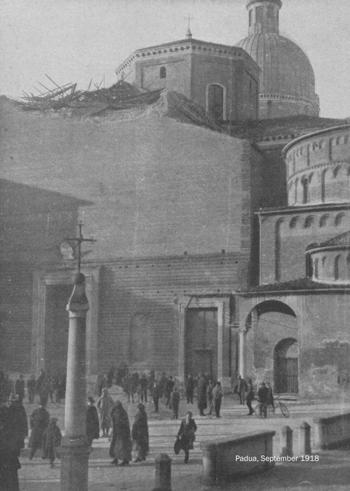
Padua, September 1918